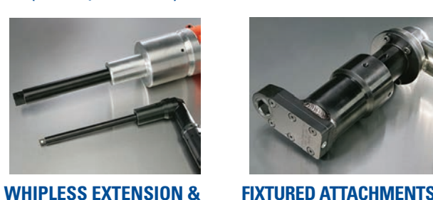
FIXTURED ATTACHMENTS & RETRACTABLE SPINDLES